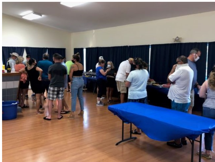
The club gathers for the Pig Roast...masks and all. It was a little warm that day, so we did social-distanced tables in the Blue Bath House.