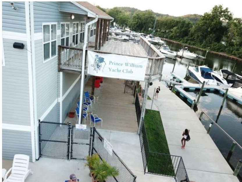
Just prior to the start of Founders' Day festivities. Happy Birthday PWYC!