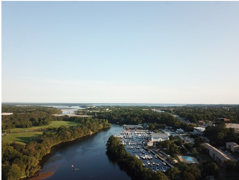
Lazy summer's day on 6 September 2020