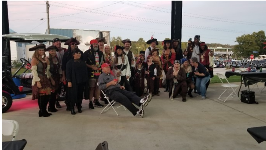
Prince William Yacht Club Pirates!!!