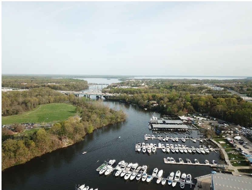
Our beautiful marina on 10 April...Opening Day.