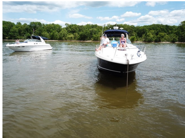
Ralph and Pat Ocasio