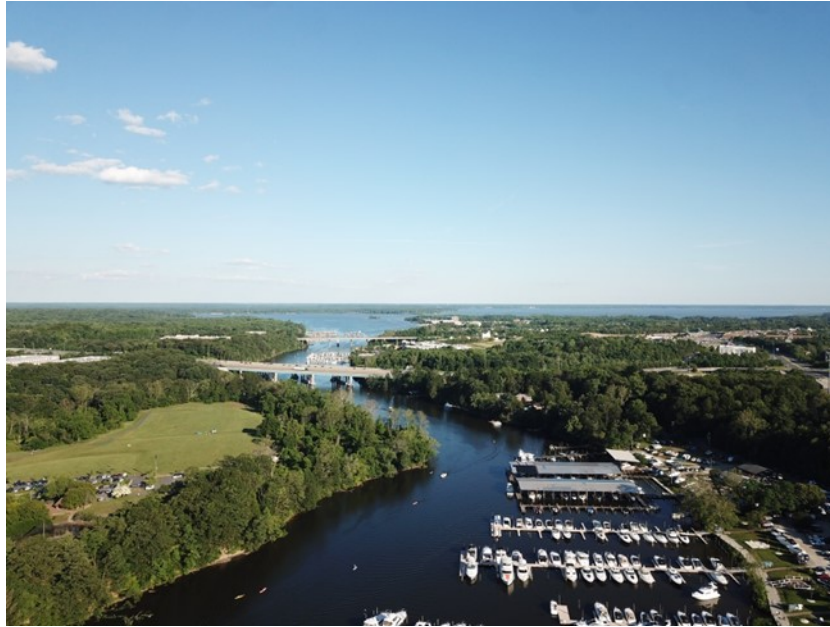
View from above the marina on 6 June.