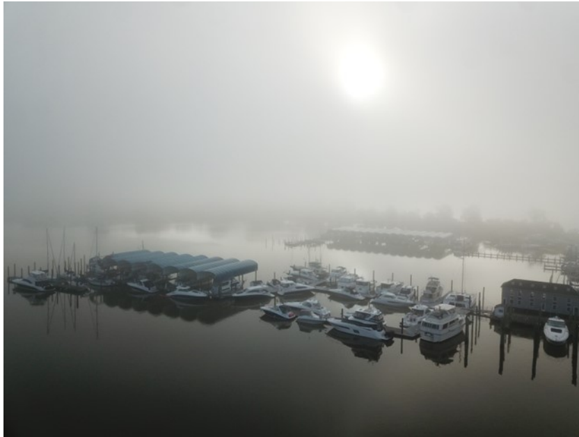
A foggy morning on 21 June.