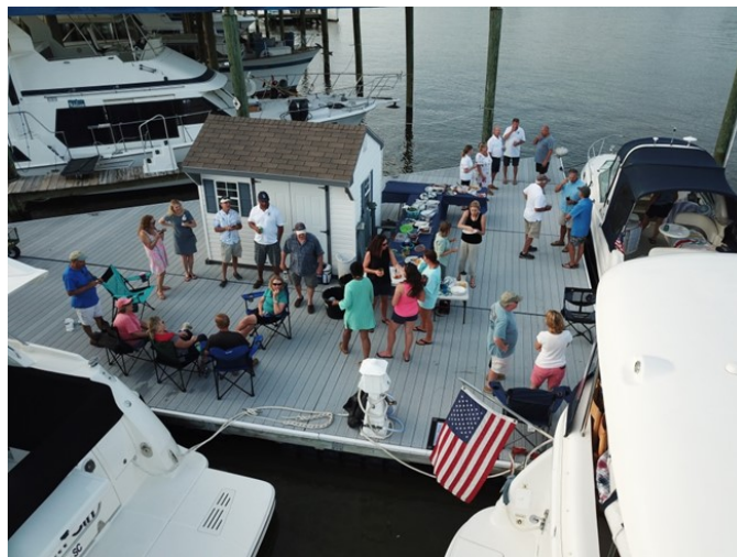
Saturday's Pot Luck with our friends from Colonial Beach Yacht Club.