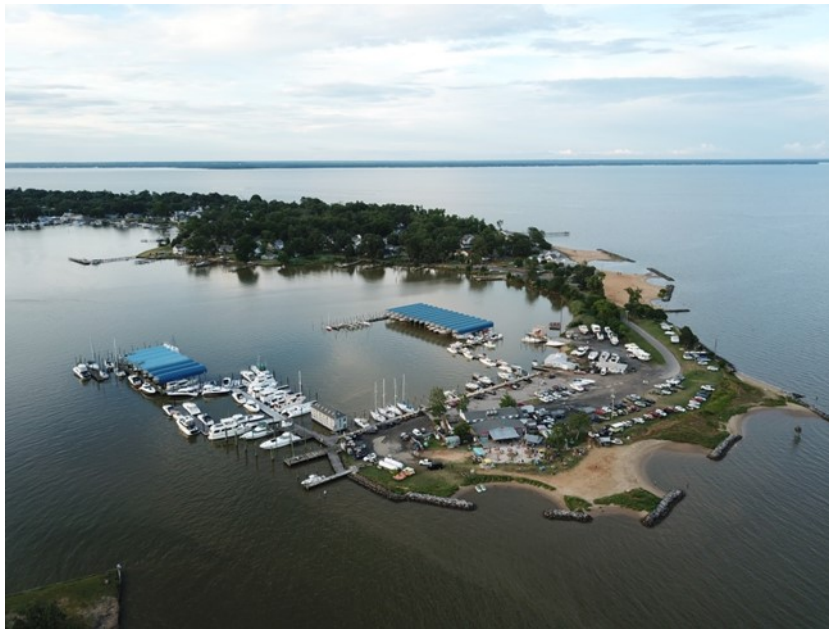
Colonial Beach, with Prince William Yacht Club in attendance, on 20 June.