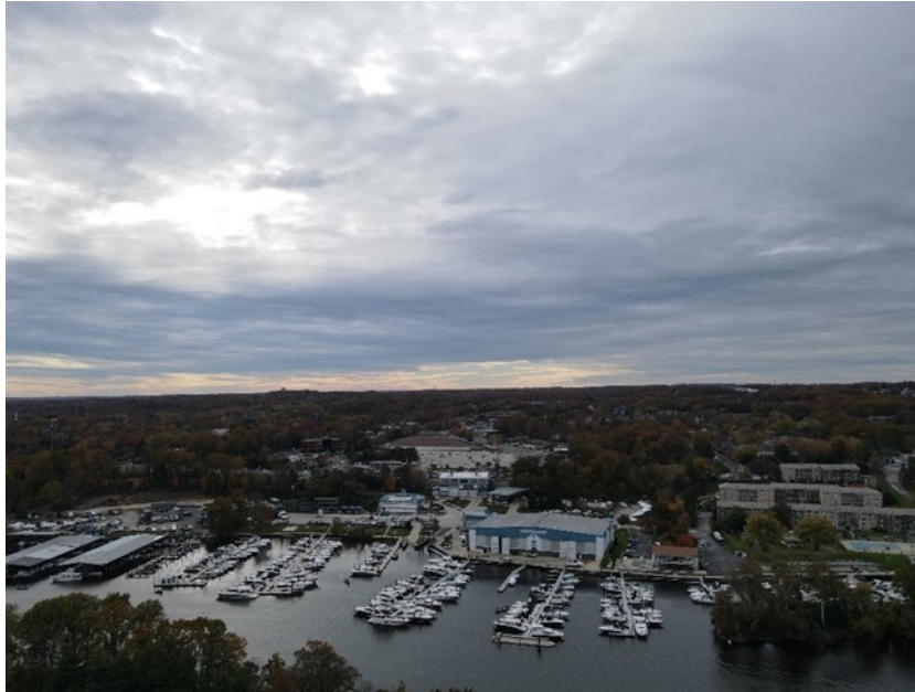
Our marina, 14 November 2021

Please be safe, remain healthy, continue to check on each other, and stay flexible.