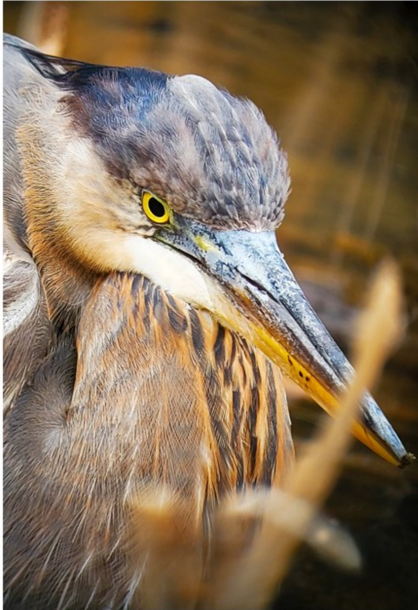
Wildlife — Blue Heron