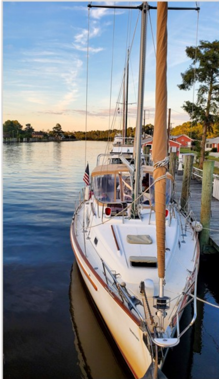
Boats Category Winner—Sailboat Serenity