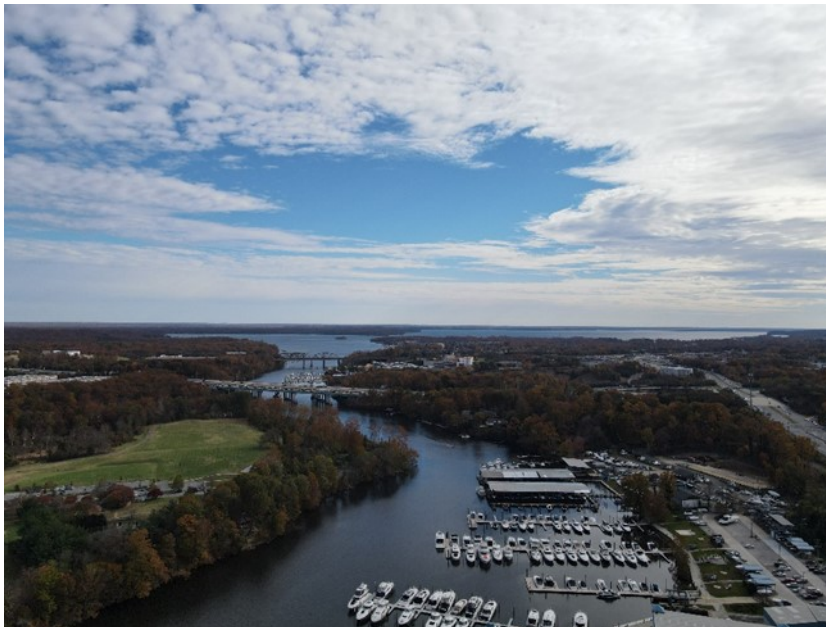
Our marina, 14 November 2021

OBTW...for those of you who've been following my drone drama, I finally got my new drone to work: