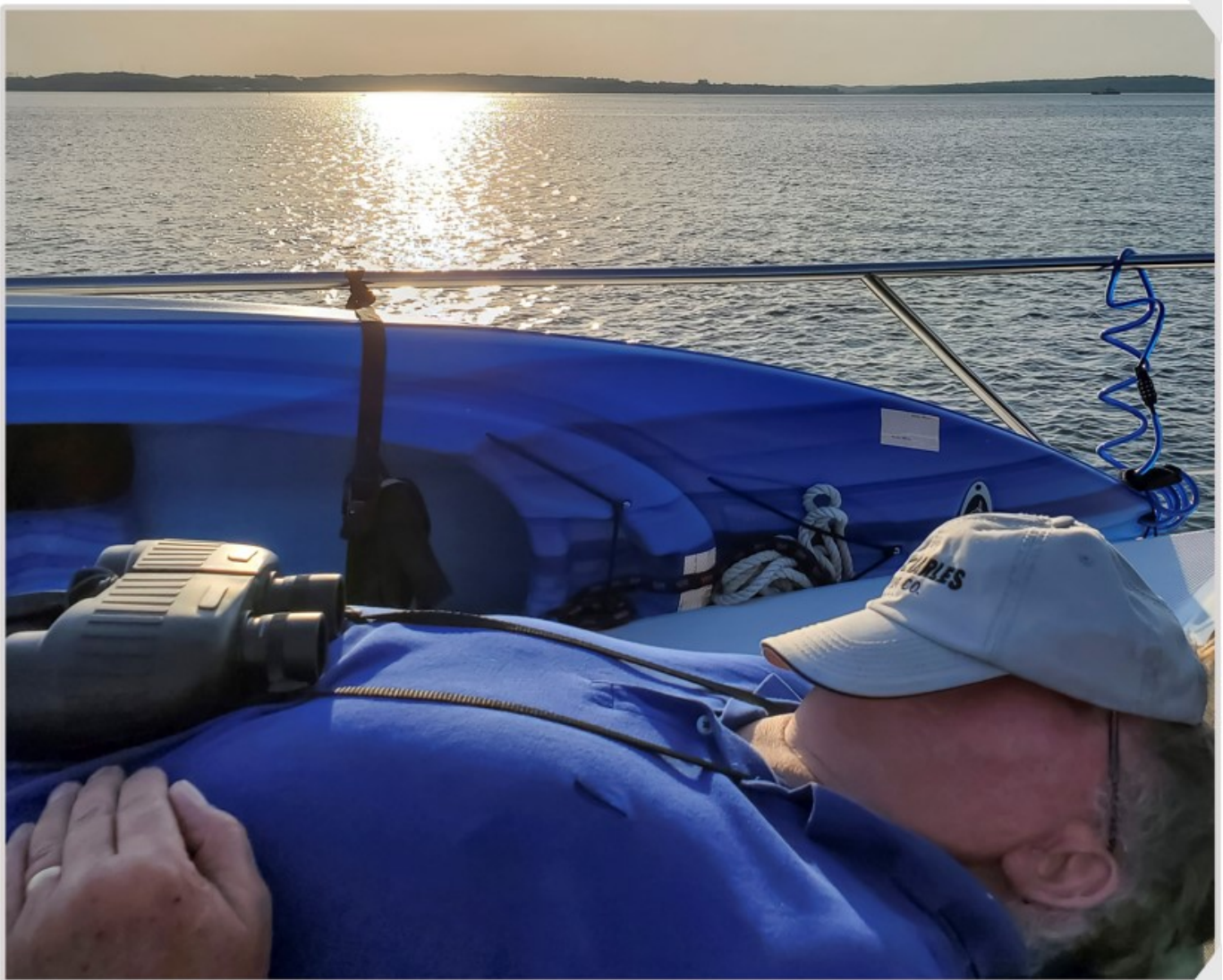
Humor — Nap Time