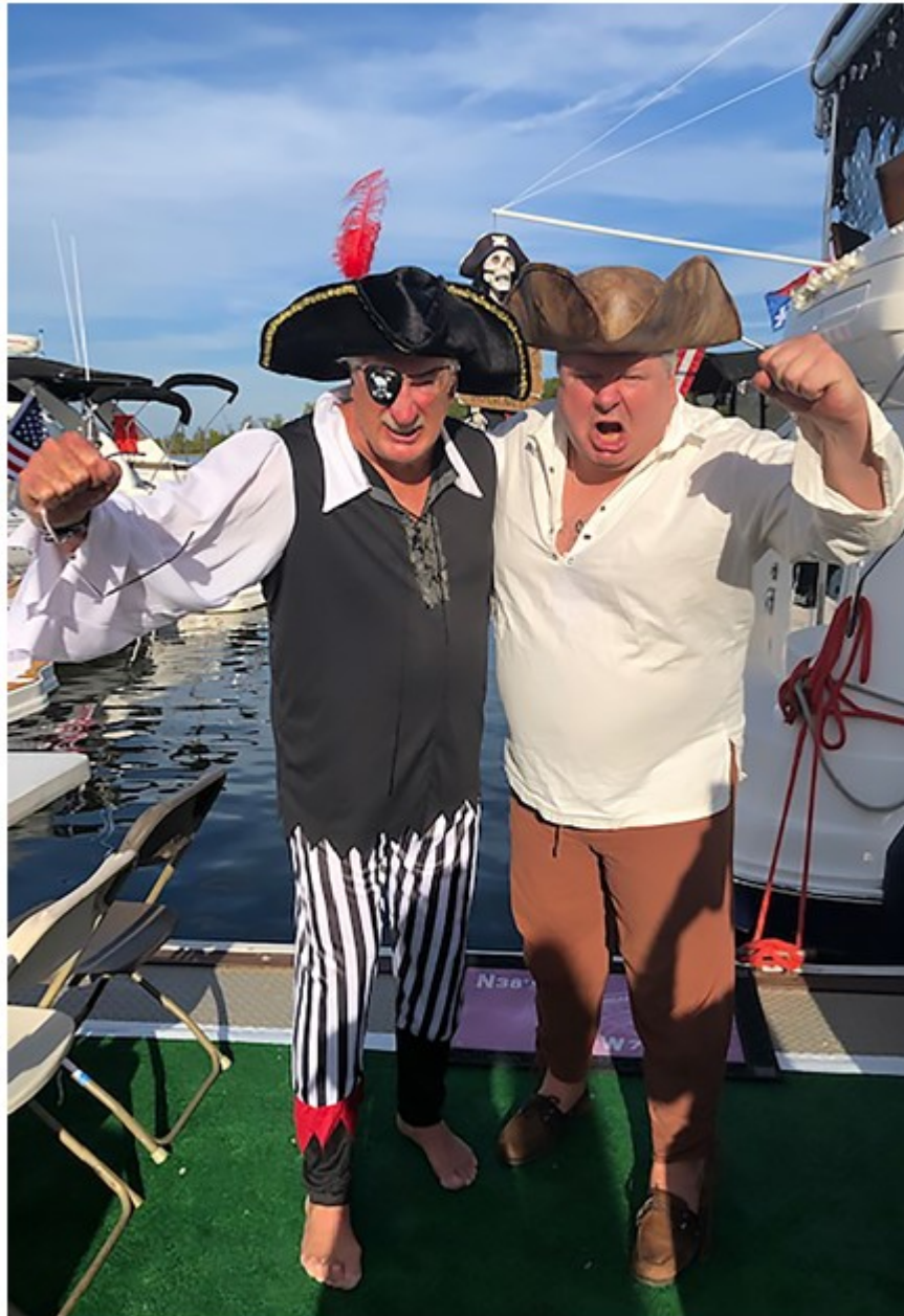
People — Commodore Pirates