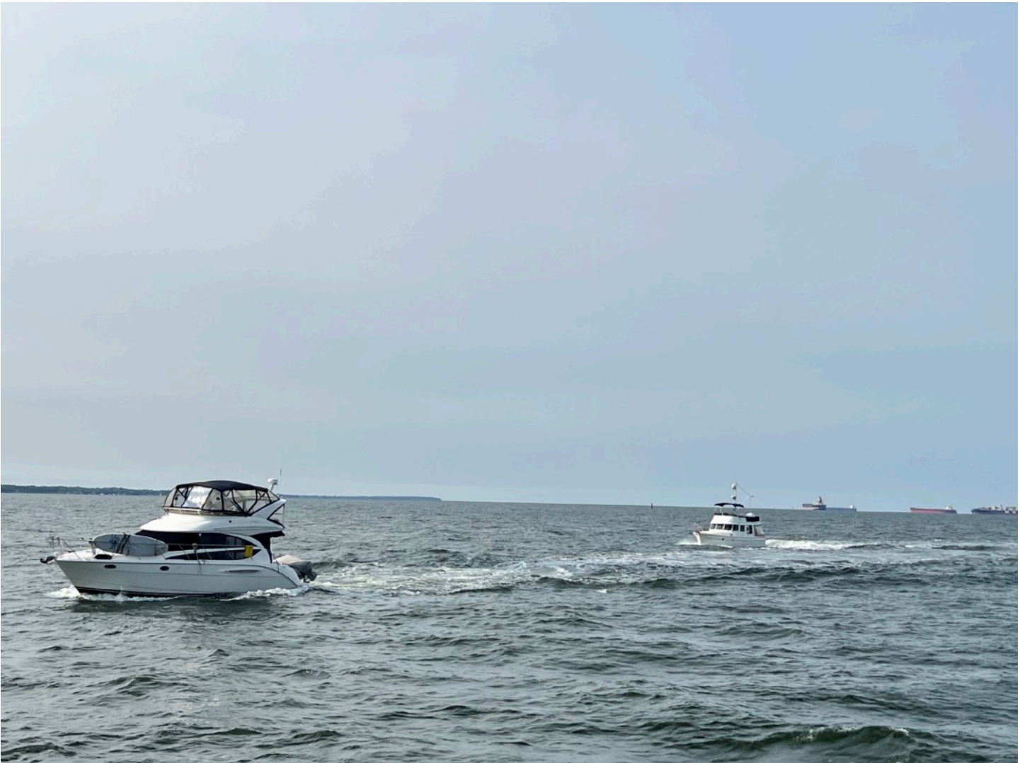
CarRussin’ and General Fun approaching the Chesapeake Bay Bridge on their way north. (May 24, 2023)