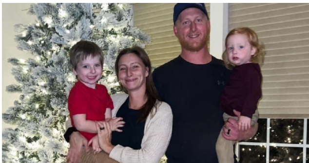
TRAGEDY STRIKES PWM

There's more to boating than "see water, GO!" Do you have a good understanding wave and swell action? Check out this months Safety Corner.