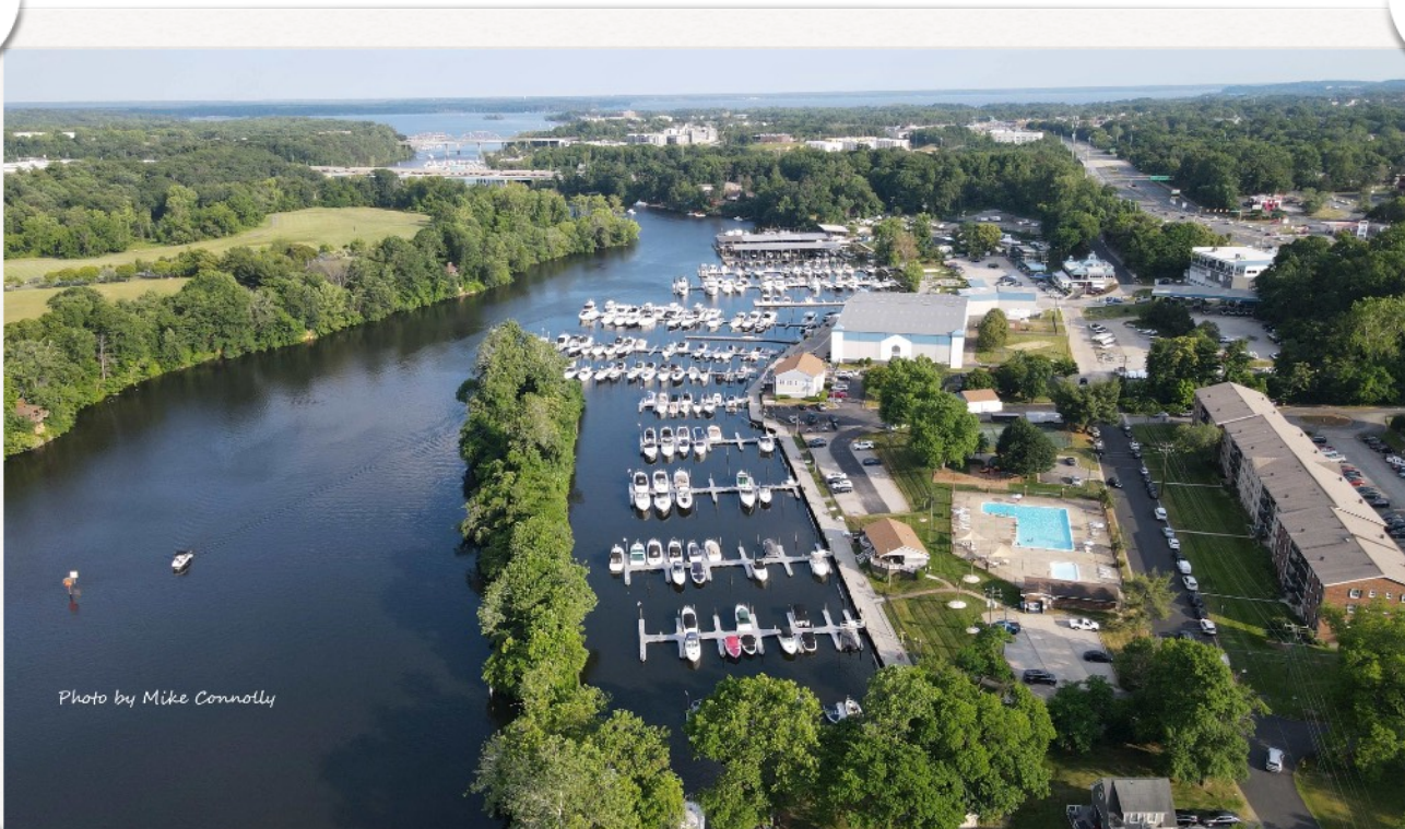
June on the Occoquan