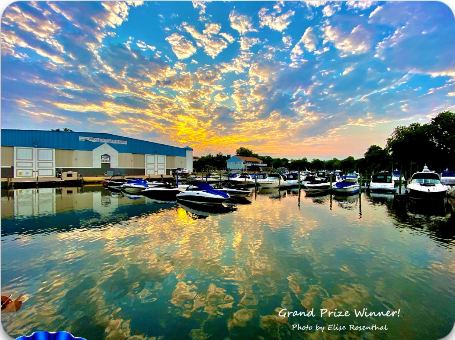
Grand Prize Winner!