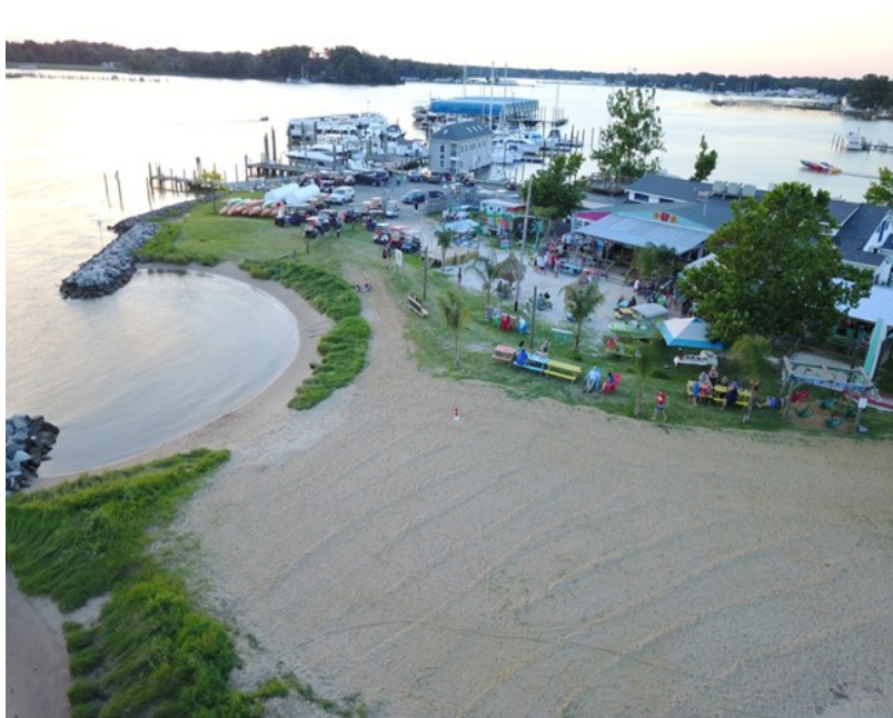
Another picture of Friday night appetizers.