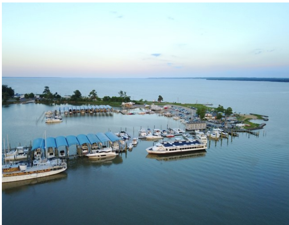
Same time as the first picture, looking the other direction.