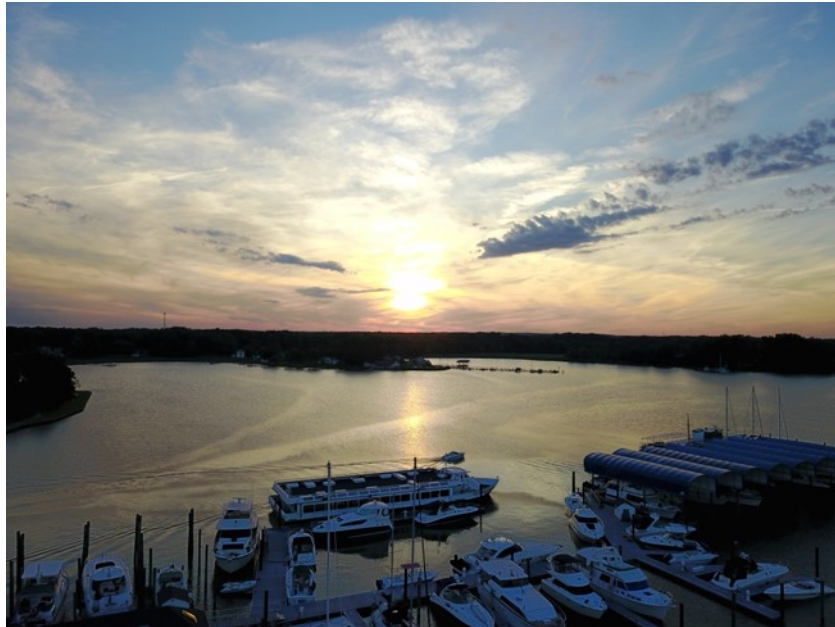
Sunset on Friday, 15 June.

Here are some pictures I took with my drone during the Father's Day Cruise.