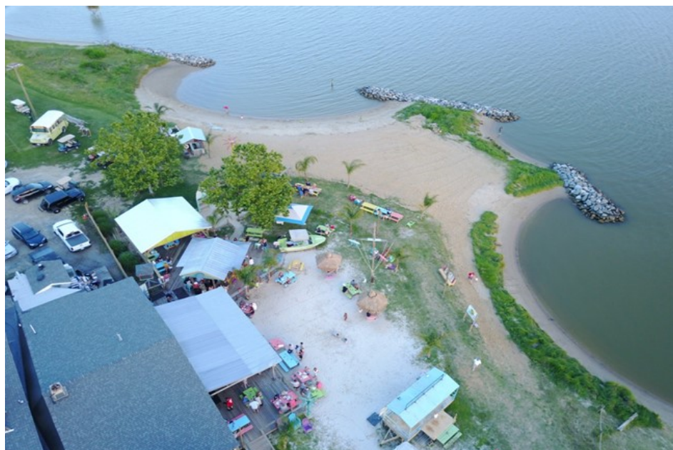
Appetizers on Friday evening.