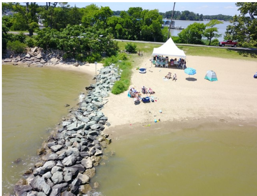
Lounging on the beach, Saturday afternoon.