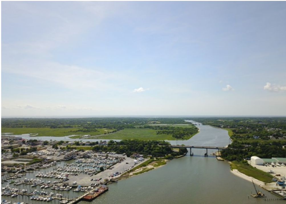
Looking west towards the Cape May Canal with Utsch's Marina in the left foreground.