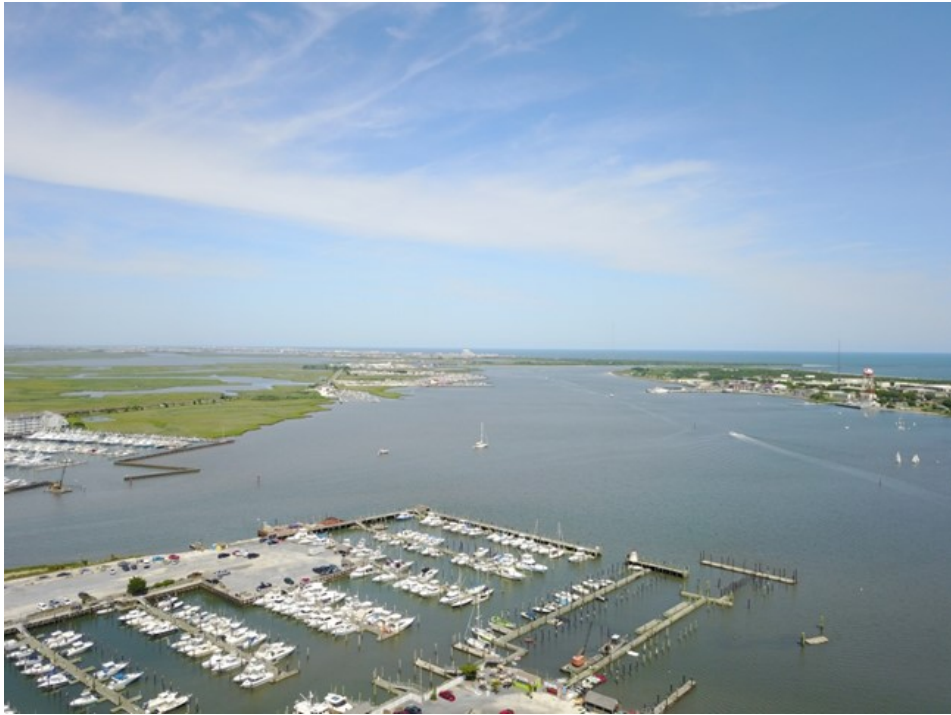
Looking east over Utsch's marina towards the entrance to the Atlantic.