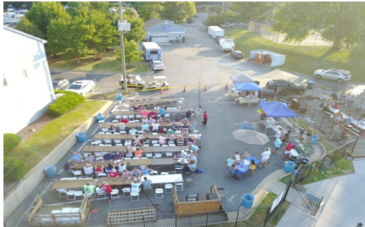
There's nothing like a whole hog and good friends