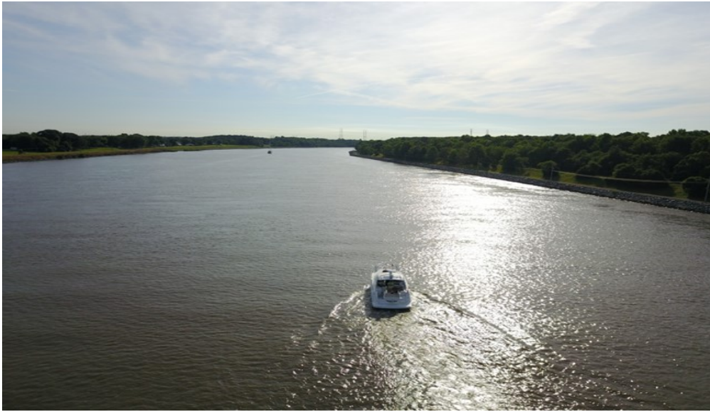
Getting underway on the Chesapeake – Delaware Canal. It's not easy to fly the drone off of the boat.