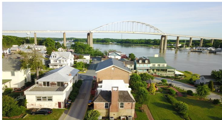
Chesapeake City looking west towards the Chesapeake City Bridge.